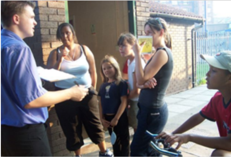
Reaching out - chatting on the doorstep - finding hidden skills