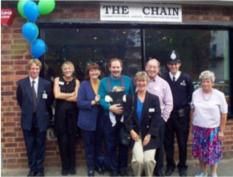
Finding the leading lights in the community