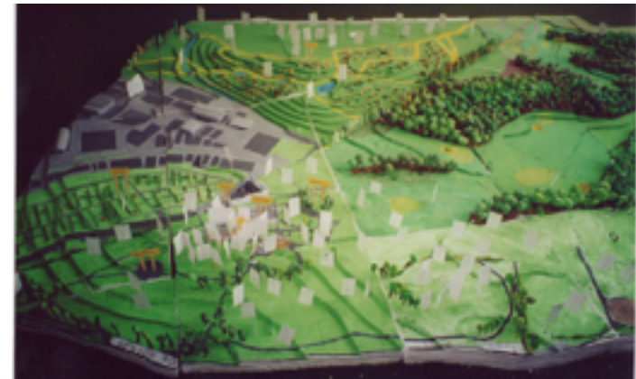
Creating the 3D model a “bird’s eye” view