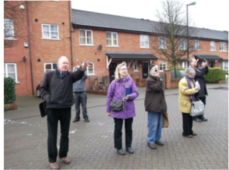
Residents and “expert” on walkabout of estate